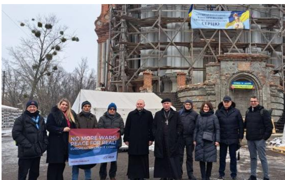
At the Greek Catholic Cathedral of St. Nicholas

You will be pleased to know that even in this complicated situation, Scouting is continuing. This year again we will be hosting Ukrainian scouts in Italy, we have received requests from 20 Ukrainian scout groups. We hope to be able to satisfy all of them. If you would like to help MASCI with this project, please contact: