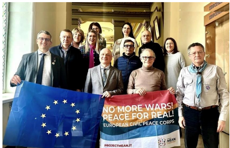
At Kharkiv University with the Rector