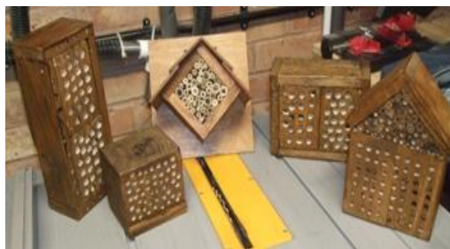
Garden Bug Boxes

Recycled pallet wood can be used for many things