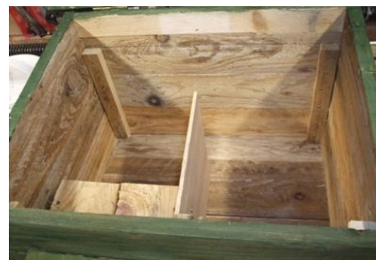
Hedgehog Box inside