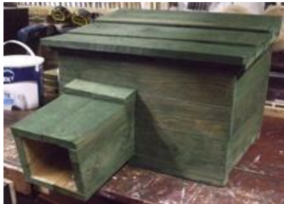
Hedgehog Box outside