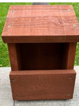
A Robin Box