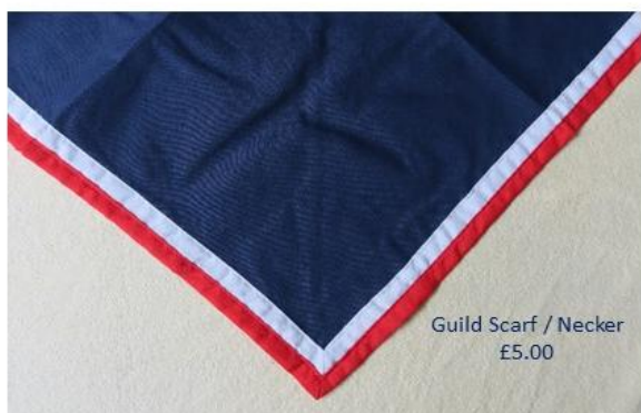
Guild Scarf / Necker £5.00

Baden-Powell Guild UK – Merchandise - Members only prices