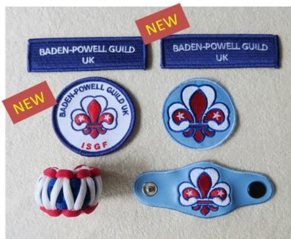
Pair of shoulder flashes 3½" x 1" (87mm x 26mm) £2.50 2 7/16" (62mm) diameter Guild/ISGF badge (above left) £2.00 2 1/8" (54mm) diameter ISGF badge (above right) £3.00 'Stourbridge' woggle (left) £2.50 ISGF woggle (right) £4.00