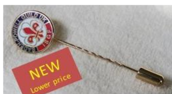
15mm metal pin badge £2.50