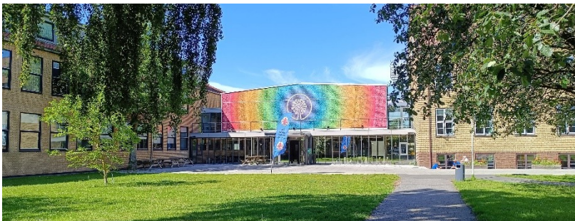
Ranum Efterskole College.