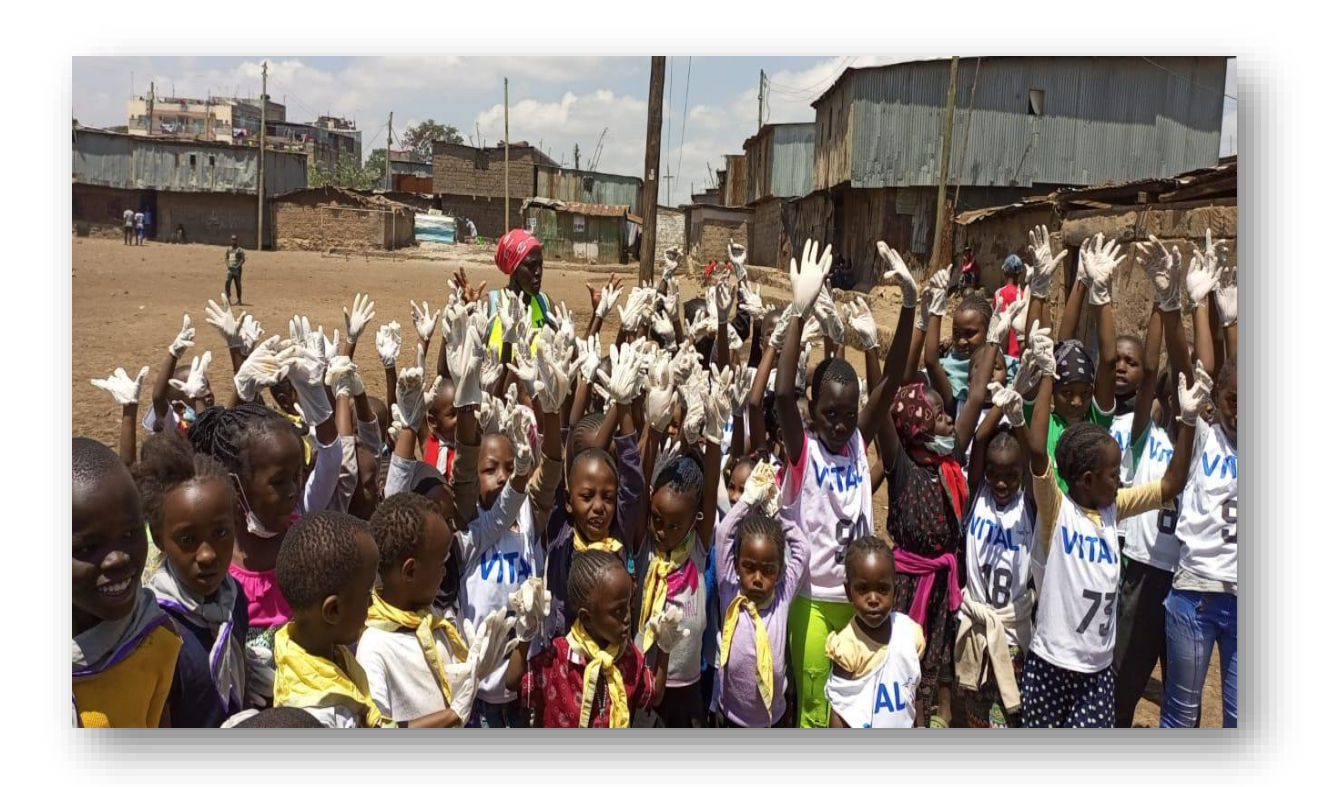
KENYA, 27 November 2021, KINYGAO LADIES CBO, Clean-up project

Kinyago Ladies Group, Nairobi receiving training on various topics at PIGEON PARK Nyeri. 13 leaders +3 trainers were present