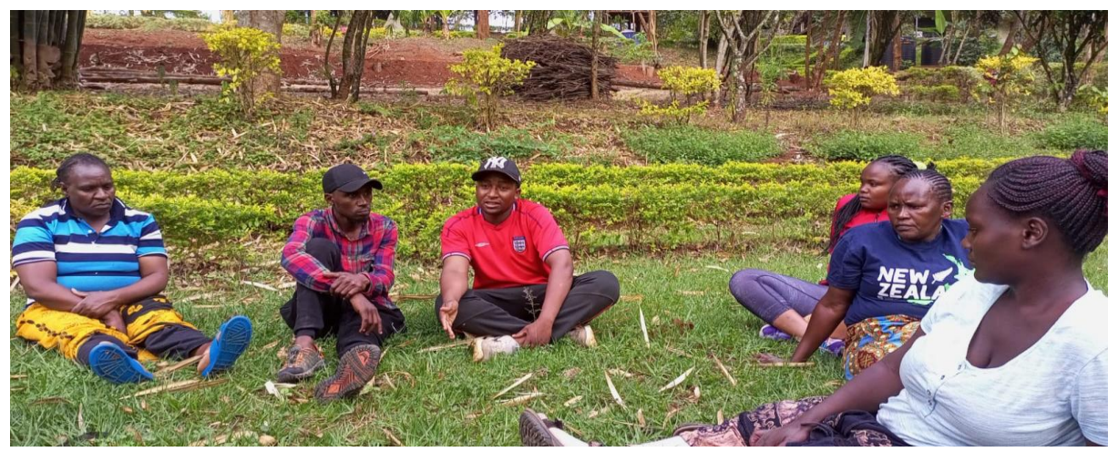
KENYA 6-9 October 2021

Kinyago Ladies Group, Nairobi receiving training on various topics at PIGEON PARK Nyeri. 13 leaders +3 trainers were present