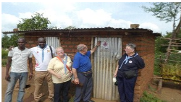
Three members of NSGF UK, visited the project at the Imvepi Refugee Camp.