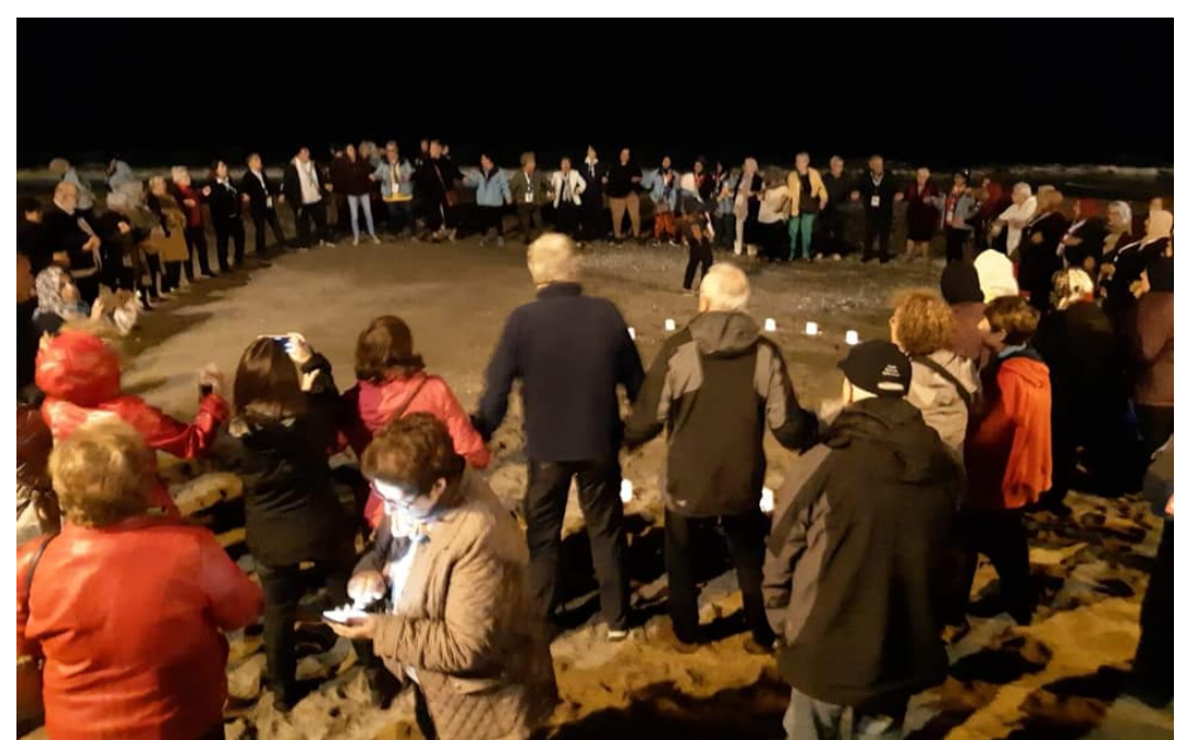
Celebrating Fellowship Day, on the Beach During the Southern Sub Region and Mediterranean Gathering in Athens in October