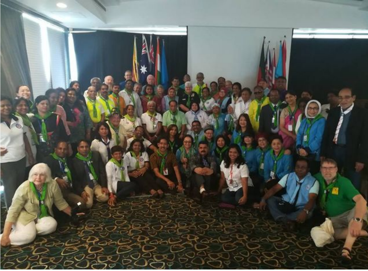
The 15<sup>th</sup> Asia Pacific Gathering was held in Sri Lanka in September

The Second Southern Africa Gathering was held in Zimbabwe in August