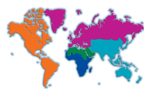
Africa – Arab – AsPac – Europe – Western Hemisphere

The ISGF World Bureau will be closed 24th December – 1st January 2019