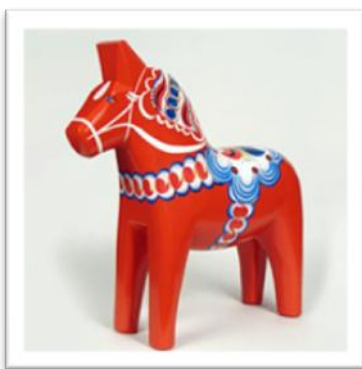
Sweden – Dalarna