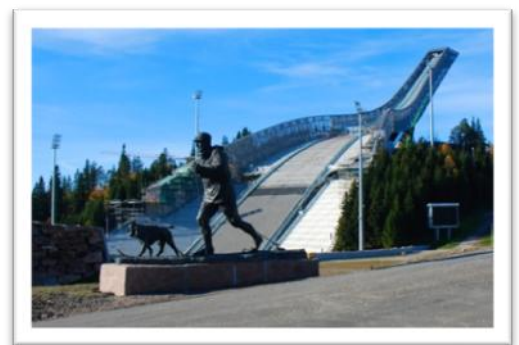
Norway – Oslo

We will later inform you about different pre and post conference tours to make in the Scandinavian countries.